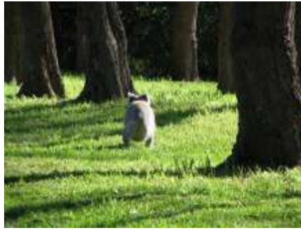
Max Escaping to Freedom